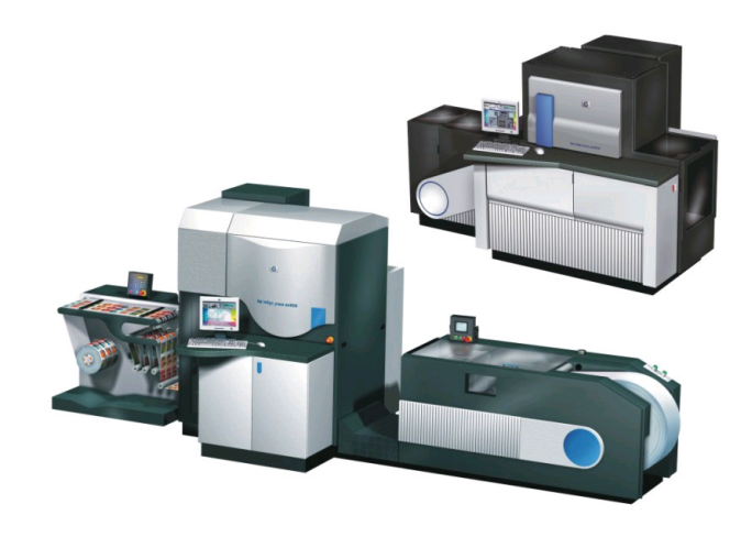
Figure 3. HP Indigo ws4050 (bottom), HP Indigo ws2000 (top)